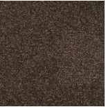
Castor Bay 1878