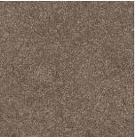
Castor Bay 1870