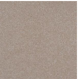
Castor Bay 1891