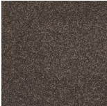
Castor Bay 1843