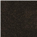
Castor Bay 1879