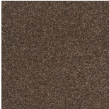
Castor Bay 1845