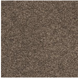
Castor Bay 1875