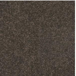
Castor Bay 1844