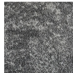
Barrys Point #1