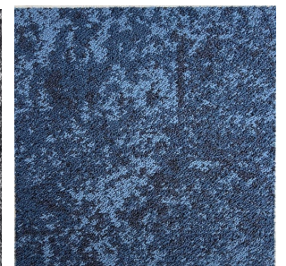
Barrys Point #4