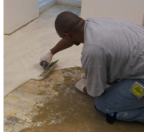
Apply adhesive to floor following manufacturer's recommendations

Once all of the cushion has been laid out, fold it back and apply adhesive to the floor. Do not staple. Special attention is to be directed to spreading the adhesive adjacent to the walls (cut-in) to prevent edge curling. Apply the adhesive with a notched trowel