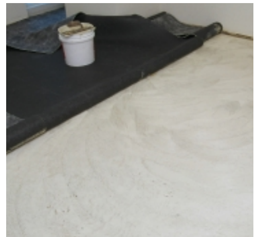
Proper open time is critical for a successful installation

measuring 1/16" x 1/16" x 1/16" or according to the adhesive manufacturer's recommendations. (See chart on page 7 for general guidelines.) Applying the adhesive