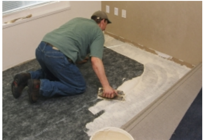
Apply adhesive to cushion following manufacturer's recommendations

Care must be taken to avoid cutting into the cushion under the seam.