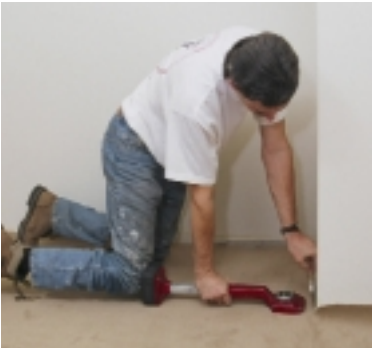
Install carpet and trim in

Once the adhesive has been spread for a given section, lay carpet into the adhesive according to the adhesive manufacturer's recommendation for open time so as to allow even distribution and penetration of adhesive on all areas of backing.