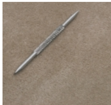
Finished seam (below tool) is nearly invisible