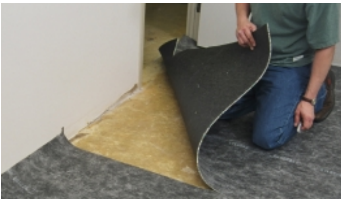
Cushion seams should have no compression or gaps