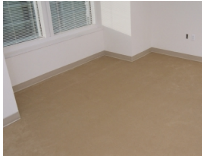
Prevent traffic over carpeted area for a minimum of 24 to 48 hours after installation

roller weight. Eliminate any bubbles by pressing straight down prior to full adhesive set up time. Do not roll bubbles to edge. Woven carpet should be rolled a second time about 3 to 12 hours after initial rolling to make sure a strong bond is established. Due to dimensional instability, double-glue installation of carpet with a unitary backing is typically not recommended. Prevent all traffic over carpeted area for a mini-