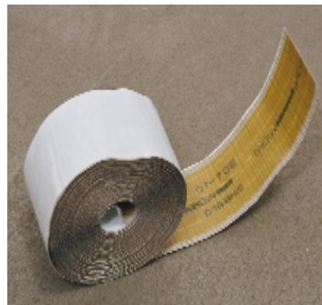
Use only hot melt seaming tape designed for double-glue installation