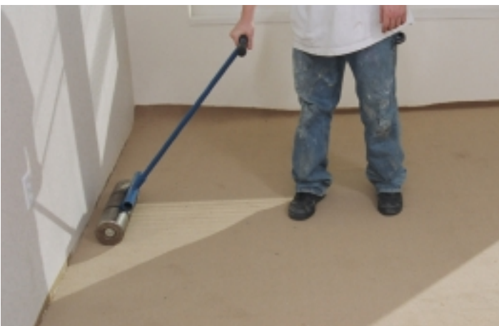
Roll in both directions to promote complete adhesion

Installation with a pressure sensitive spray adhesive system is an acceptable method for gluing cushion to floor. To be successful, this method should be performed by a Spray Certified Installation Technician. A firm cushion that is designed for double-glue installation is