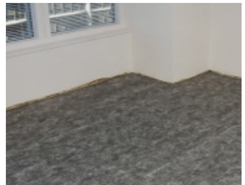
Cushion installation complete

with a paint roller can result in an inconsistent application. Consult the adhesive manufacturer for the best application technique. For bonding, the cushion