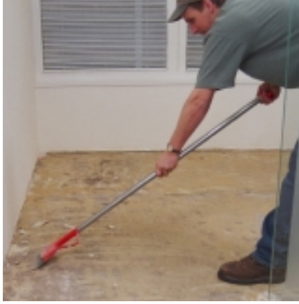
Start with a clean, dry, and smooth floor

The floor should be free of holes and loose tiles or boards. Repairs should be made as necessary to provide a smooth surface for carpet and cushion installation. The floor should be dry and dust-free. All contaminants that may prevent good adhesion need to be removed. Floors should be vacuumed, mopped if necessary, and otherwise thoroughly cleaned prior to carpet installation. Excessive use of water for cleaning is not recommended, though mopping with a slightly damp mop is useful to remove dust from the floor surface. Architectural tack strip, properly spaced and secured, may be used to hold the carpet edges in place. Setting cove base on top of carpet will also secure edges.