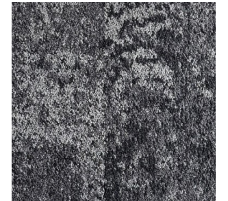
Barrys Point #3