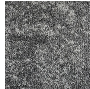
Barrys Point #1